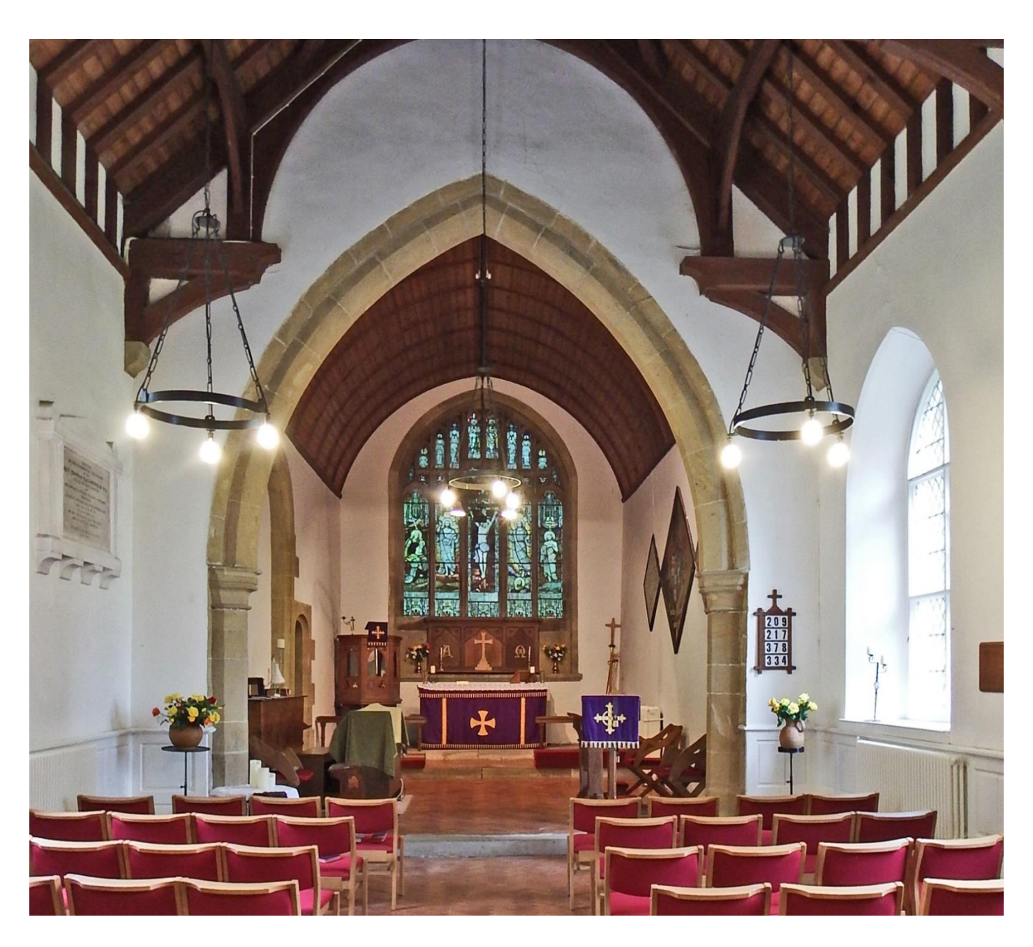
Interior looking east

The interior of the vestry has been sub-divided in the relatively-recent past, a kitchen replacing the organ with a toilet alongside on the north.