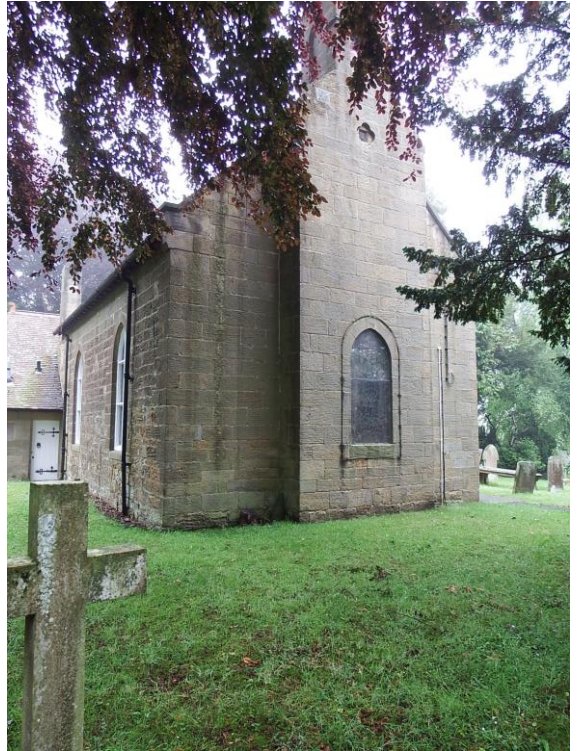
The church from the south-west (left) North-west view (right) Chancel from south