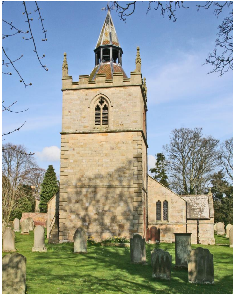
The church from the west