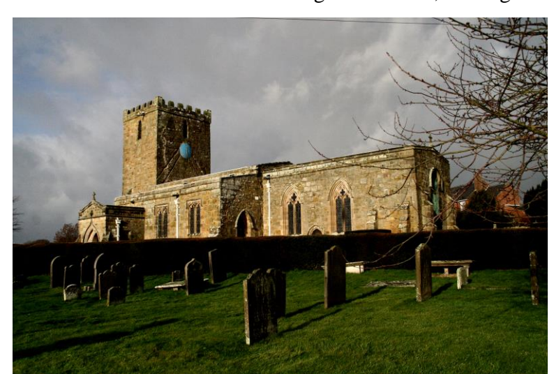
The church from the south east

is now no sign of these in the fabric above. The buttress on the south has a series of chamfered offsets and rises to a little above the top of the first stage. The base of the eastern part of the north wall is concealed by a modern sunken boiler room; a shallow buttress-like feature rising above this in the angle between tower and aisle is in relatively recent masonry, and probably part of a flue.