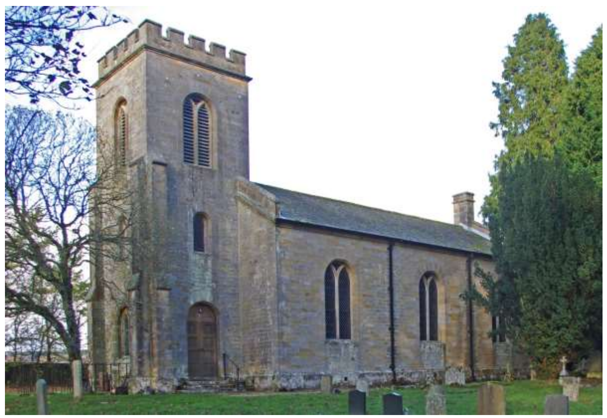
The Church from the South West