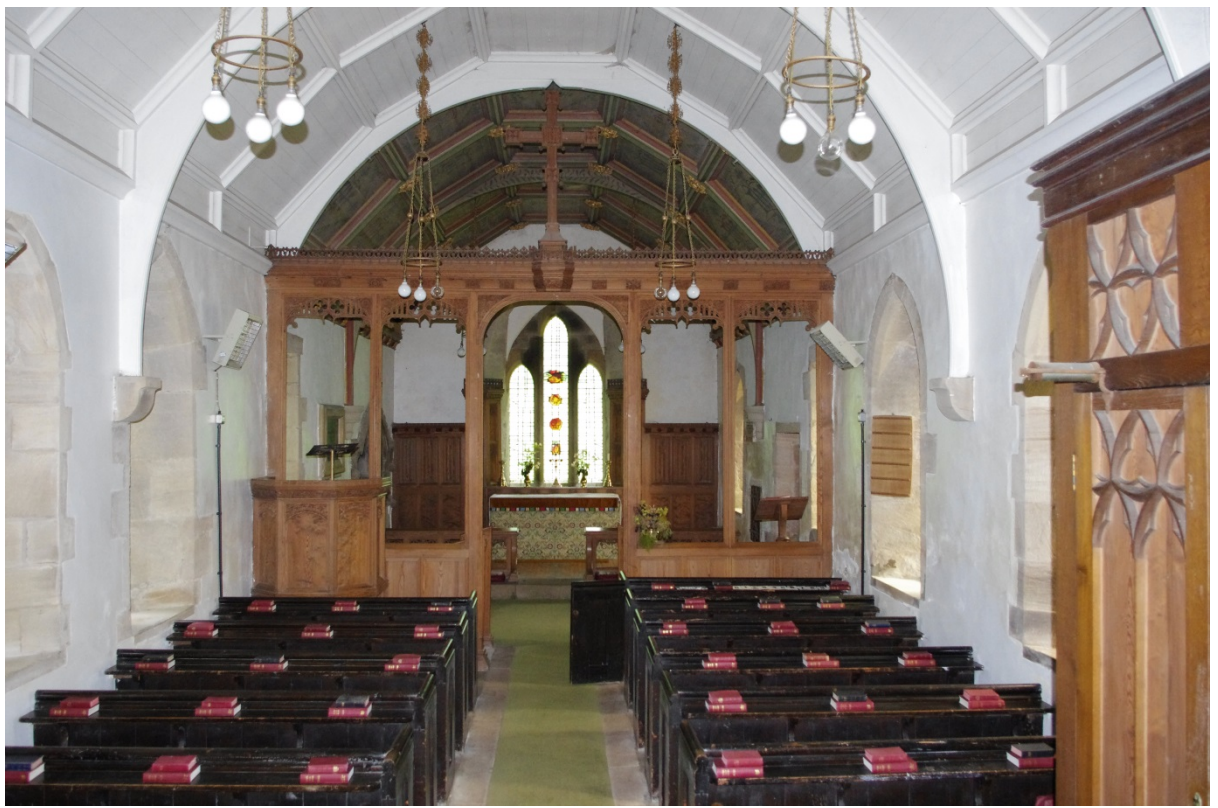
Interior looking east

The church is entered through the south door, with three steps down to the nave floor; the door is enclosed by an internal wooden porch of 1892. The interior of the building is a simple rectangle, divided only by an attractive 1892 openwork timber screen; the walls are plastered, except for exposed dressings (and the lower part of the south wall to the west of the entrance). The opposed north and south doors have shallow segmental-pointed rear arches with chamfers to their heads only; the side walls of the nave are only 0.63 m thick, and neither doorway shows any evidence of a drawbar tunnel. The north doorway now opens into the 19th century vestry, and is identical to the south door, but generally better preserved although parts of the imposts have been cut back.