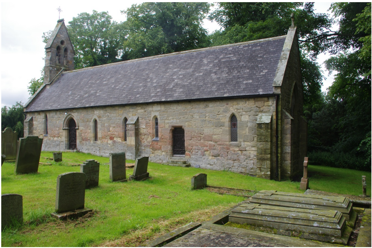
The church from the south-east

The south doorway has a two-centred arch of one chamfered order, with moulded imposts carrying a hoodmould, chamfered above and below, with shaped stops; parts of the jambs have clearly been renewed. There are five lancet windows; the first, set west of the door, is markedly taller than the others, with its head just below the eaves. The second is 19<sup>th</sup> century work and the fourth, just beyond the buttress marking the division between nave and chancel, has a shallower four-centred head; in effect this (together with an identical opening in the north wall) is a 'low-side window'<sup>3</sup> although its sill is in fact set slightly higher than the others. Between the two lancets on the south of the chancel is a priest's door on the south of the chancel, which has a simple chamfered shouldered arch.