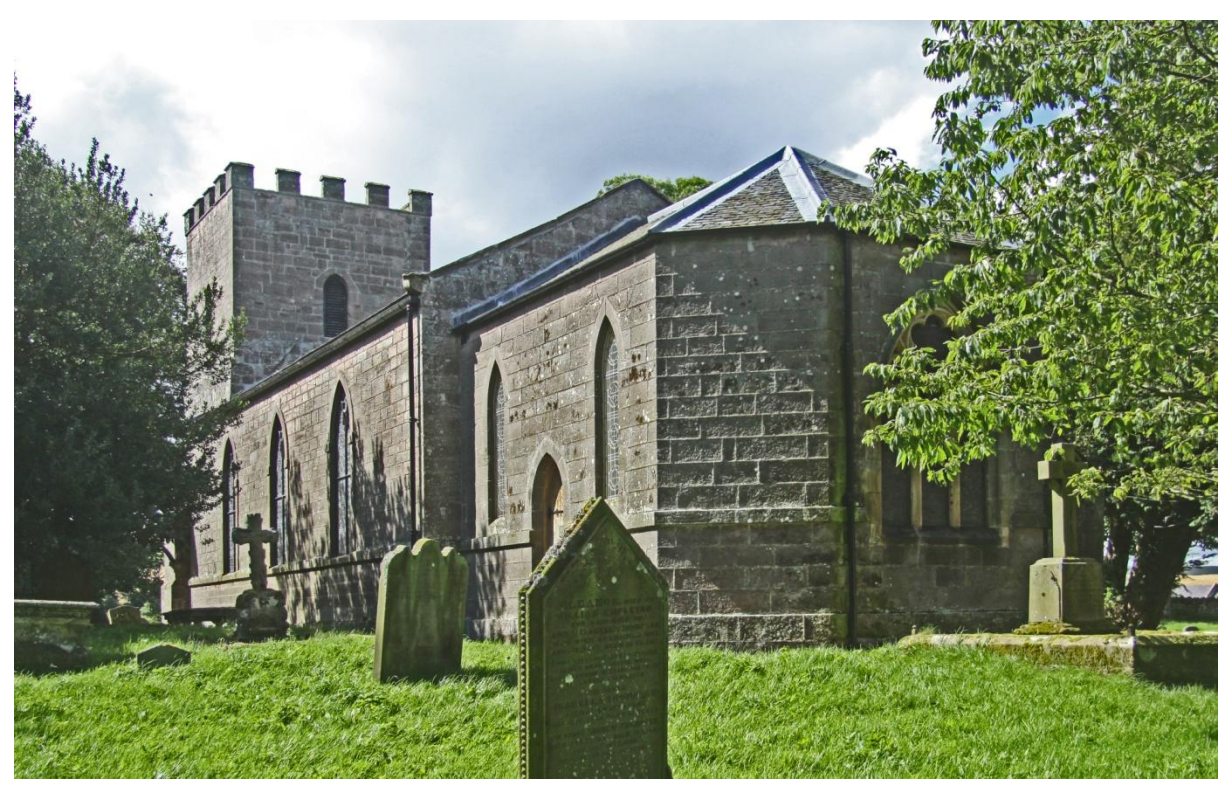
The church from the south-east

Ilderton Parish Church stands roughly at the centre of a sizeable sub-rectangular churchyard, on land that overall slopes away gently to the south, but appears to be ramped up to the north and west walls of the building, which consists of an aisleless nave with a narrower west tower, a chancel with a polygonal eastern apse, and a north-eastern vestry. The most detailed published description of the building is by H.L.Honeyman, in the Northumberland County History XIV (1935) 259-262 (hereafter NCH).