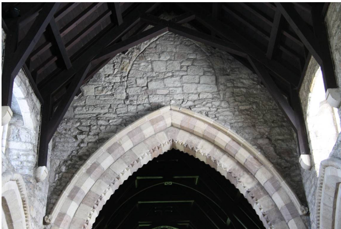
The 1866-7 chancel arch and older walling above, with early roof-line and outline of large window of uncertain date.

The Chancel is entered under a tall two-centred arch of two chamfered orders, the inner, with bold dog-tooth ornament on its chamfer, carried on corbels which have short shafts with Transitional-style capitals – these look to be genuine late-12 th century work re-used - and the outer continued down the jambs; there is a hoodmould with cross paté stops. The voussoirs of the arch are of alternating pink and yellow sandstone. In the rubble walling above the chancel arch above the chancel arch the line of an early steep-pitched roof is visible (pre-dating the clerestory) and, in the gable, the outline of a large and rather mysterious Gothic-arched window (see ‘The Development of the Church’, below).