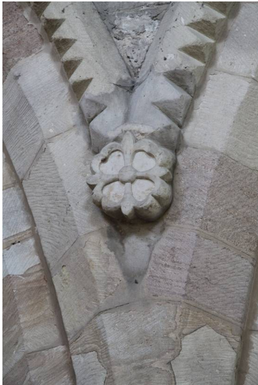
Hoodmould stop of the south arcade, showing dog-tooth ornament on hoodmould above.

of an earlier window at this level is on the south, between the western and central openings, where the east jamb of an earlier window is clearly visible.