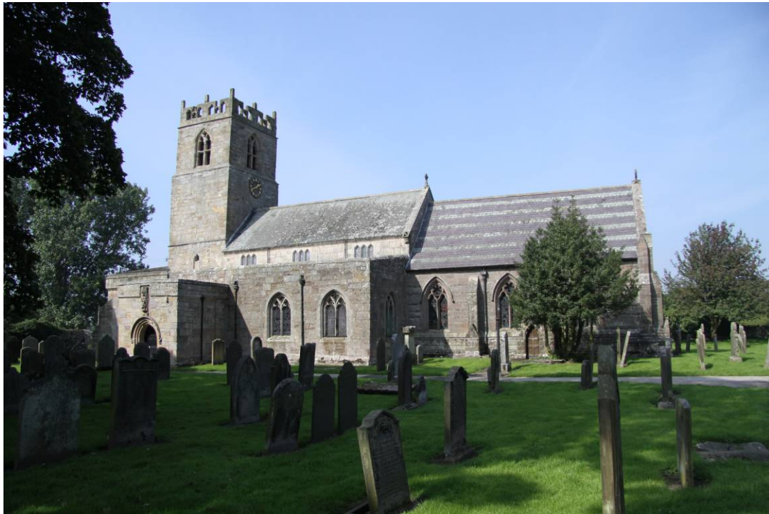
The church from the south

The parish church of the Holy Trinity stands at the south end of Embleton village, a little to the north-west of the partly-medieval rectory. The church consists of a three-bay nave with a western tower, aisles (which extend westward to engage the tower), a south porch, and the small Craster Porch on the north of the east end of the north aisle, a three-bay chancel with a north vestry and small organ chamber.