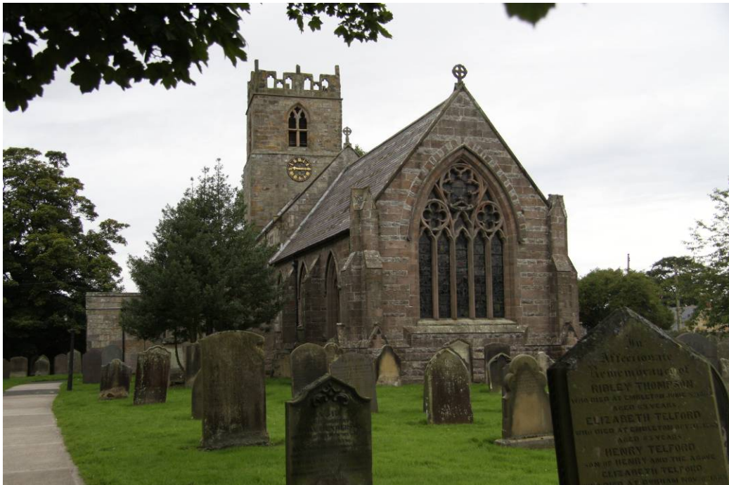
The church from the south-east