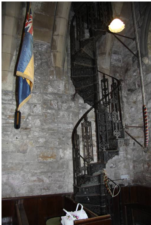
Interior of the tower looking south-west; the central vaulting rib cuts the rear arch of a 12 th -century window.

The Tower opens into the nave by a two-centred arch of two chamfered orders, with a small chamfered hood that may be a 19 th -century addition. The inner order is carried on responds with keeled shafts that have moulded capitals and bases, whilst the outer is continued down the jambs. The responds seems to have been re-tooled or re-cut in places, whilst towards the nave they are flanked by areas of 19 th -century tooled ashlar. The west wall of the nave above the arch is of roughly-coursed and roughly-tooled stone, with a number of disturbed areas. The clearest feature is the old line of a shallow-pitched nave roof a little below the present one. To the north of the top of the arch is a possible blocked doorway – a couple of blocks of its north jamb seem clear – and to the south a ragged break including two big squared blocks that might be 19 th -century stitching.