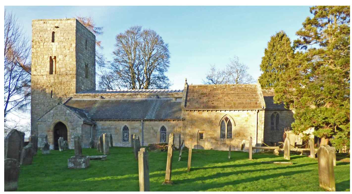
The church from the south