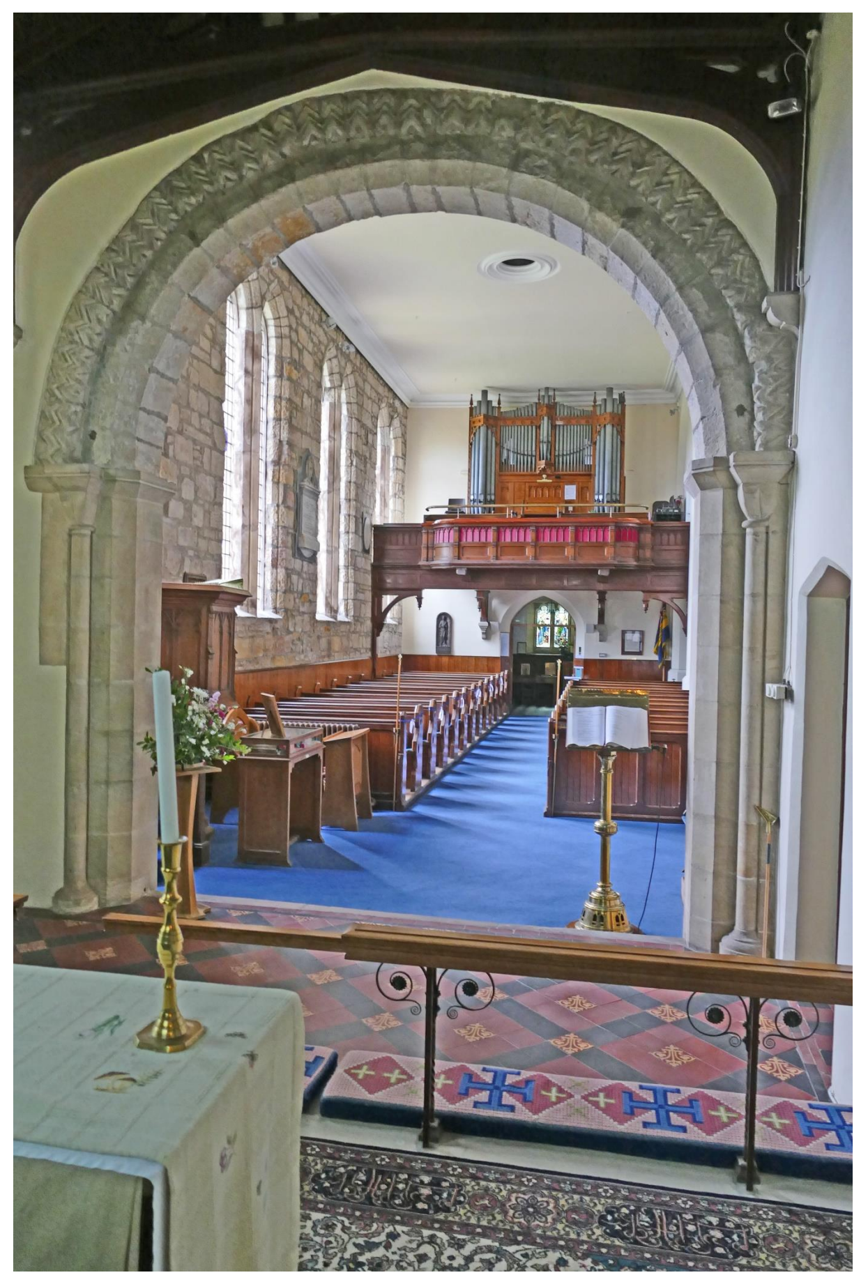
East face of chancel arch