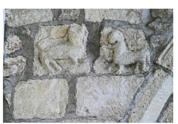
looking east. Re-used Romanesque stones I. and r. of arch