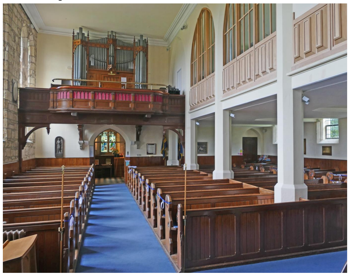
The nave looking north-west

several infilled sockets, which must relate to a roof strucrture prior to the present one. The west wall and tower arch is partly concealed by an elaborate organ loft, its rear supported by arch-braced wall-posts springing from shaped ashlar corbels on either side of the west door, and is front, just short of the westernmost pier of the north arcade, on a pair of wooden posts. The gallery, which is probably of later-19<sup>th</sup> century date, ends c 1.5 m short of the south wall. The north arcade has four lofty segmental-pointed arches with chamfered surrounds, the chamfers being continued unbroken down the octagonal piers, which had high chamfered bases.