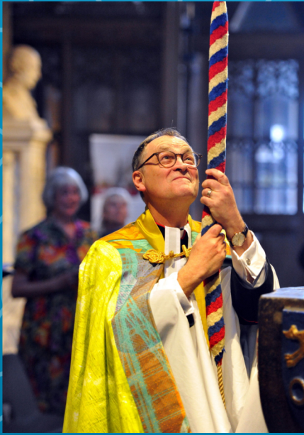
The Dean at his collation, induction and installation on 20 October 2019