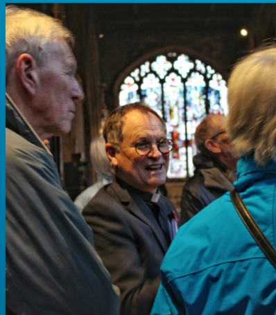
Leading one of The Dean's Farewell Tours in October 2022

Extracts from NRSV are © 1989 National Council of Churches USA Some material in this leaflet is © 2000 the Archbishops Council