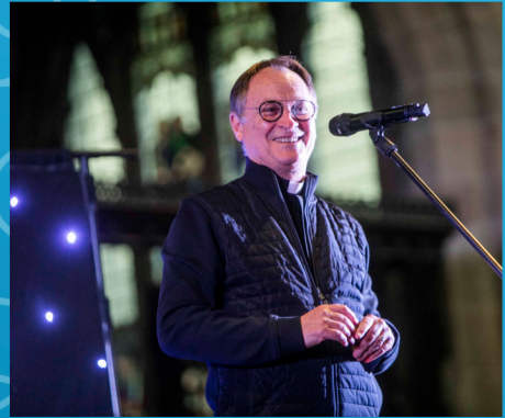
Above: Introducing the first Cathedral of Comedy event in May 2022