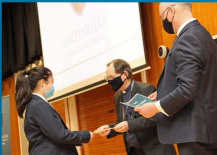
Presenting prizes to students at Grace College during the Covid-19 pandemic