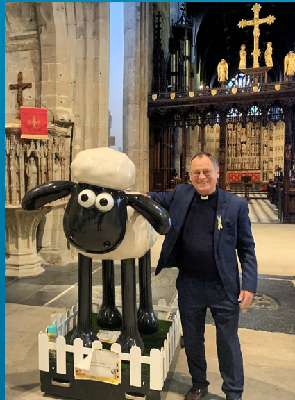
With Shaun the Sheep at a sponsorship event for the 'Shaun on the Tyne' art trail in November 2022