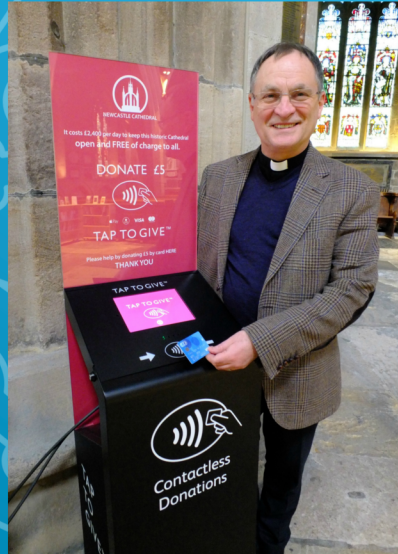
Demonstrating the Cathedral's new contactless donation terminals in 2018