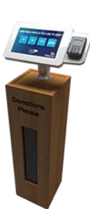
Midi with Cashbox