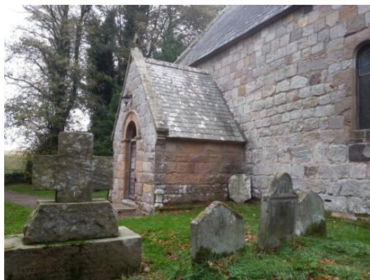
Holy Trinity at Old Bewick