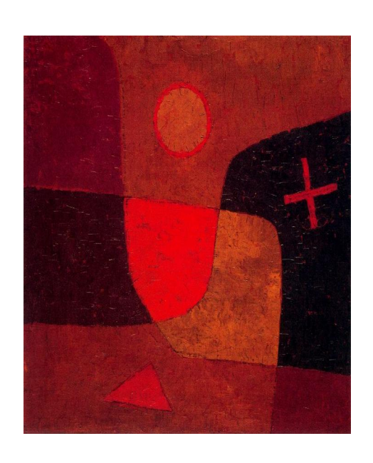
Well-filling 18/19 July 2022